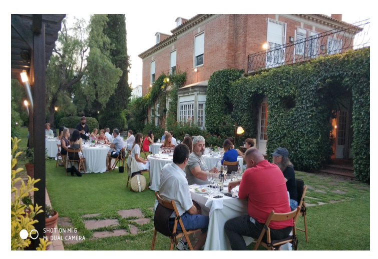
Marimar's house in Sitges, the seaside resort south of Barcelona, is the perfect venue for a great party.