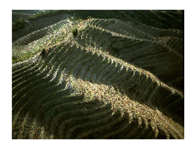
WE'LL VISIT OUR SPECTACULAR VINEYARD AND WINERY IN PRIORAT