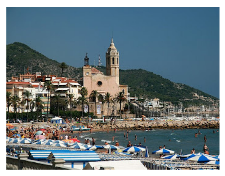
"La Punta" is Sitges' distinctive church, with its picturesque spire that appears in most postcards.