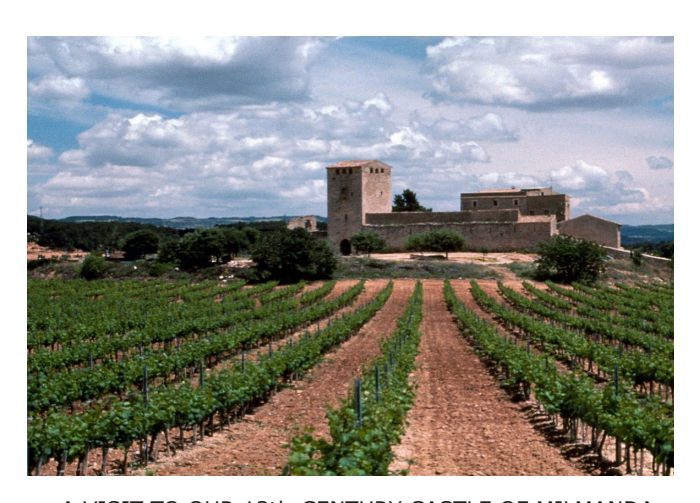
A VISIT TO OUR 12th-CENTURY CASTLE OF MILMANDA AND VINEYARDS IS ALSO IN THE ITINERARY