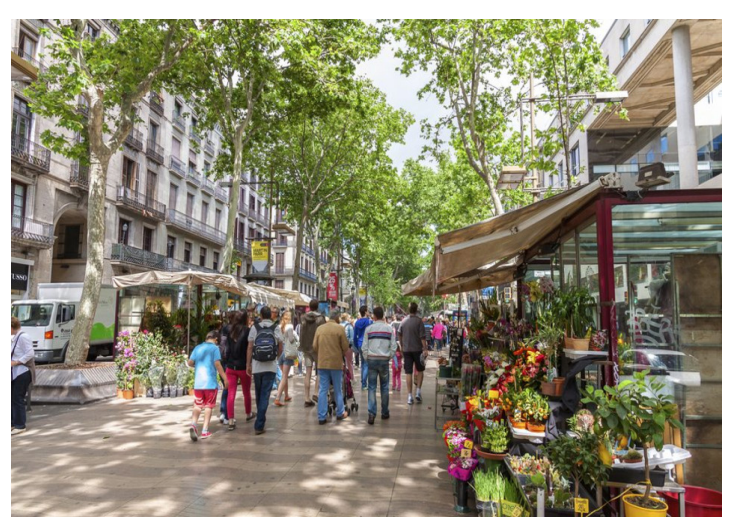
Las Ramblas, the gorgeous promenade in the old city of Barcelona.